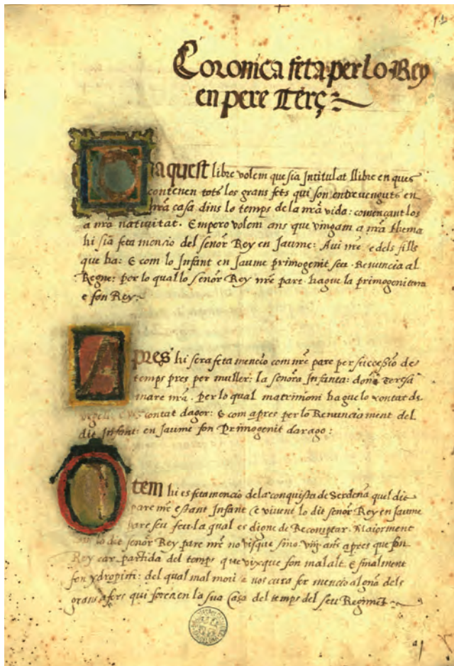
FIG. 5: Start of the Chronicle of Peter III the Ceremonious . Biblioteca de Catalunya, ms. 976, f. 1r (copy from the 16th century).

great-great-grandfather, James I, had felt; his father only became king because his uncle gave up the throne, and despite his feeble constitution, he survived an elder brother who would have reigned, along with the intrigues of his stepmother and other relatives. He was convinced that his duty was to conserve and strengthen the inheritance he had received and the memory of the family lineage, that is, to guarantee the continuity of their domain. Despite his authoritarian leanings – which were visible in the coronation, when he threatened the archbishop of Zaragoza if he dared to touch the crown that only he wanted to put on his own head, and in the reforms he planned – the country's sociopolitical structure and the scarcity of the royal domain prevented him from laying the groundwork of a modern authoritarian monarchy. Paradoxically, this failure, coupled with his meticulous and orderly nature, led him to promote estate-based parliamentarism and the inherited monarchy model, which essentially remained in place following his redesign until the conquest and annexation of the Crown of Aragon to Castile in the early 18th century.