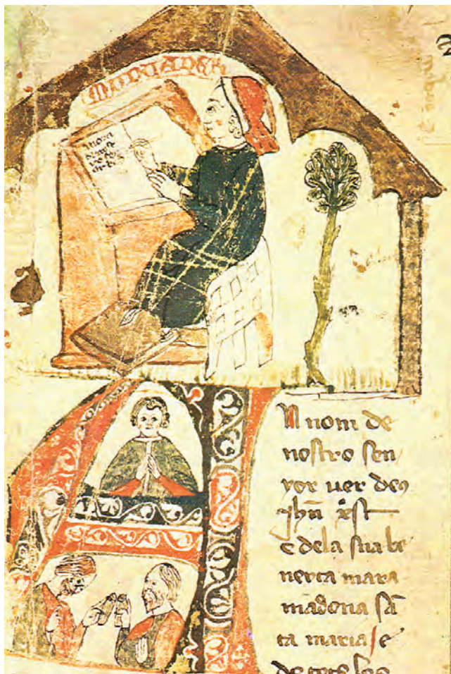
FIG. 4: The author writing his work, in a manuscript of the Chronicle by Ramon Muntaner. Biblioteca del Real Monasterio de San Lorenzo de El Escorial, ms. K.I.6, f. 1r (copy from the second quarter of the 14th century).

The Chronicle by Ramon Muntaner is the third and most extensive of the great Catalan chronicles (Fig. 4). 13 Unlike Desclot, Ramon Muntaner (Peralada 1265-Ibiza 1336) is a well-documented figure. Muntaner was born in the small yet active town of Peralada, in NE Catalonia, at that