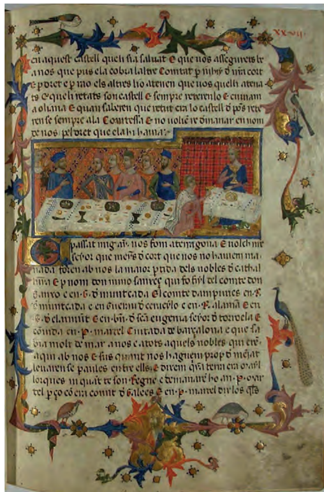
FIG. 2: James I at a dinner in Tarragona in 1228 where the conquest of Mallorca was planned, in a miniature from the Llibre dels fets del rei En Jaume . Biblioteca de Reserva de la Universitat de Barcelona, ms. 1, f. 27r (copy made in Poblet in 1343).

The first of the great Catalan chronicles is the Llibre dels fets del rei En Jaume (“King James’ Book of Deeds”) (Fig. 2). 4 James I the Conqueror (Montpellier 1208-Alzira 1276) had a long, seminal reign (1213-1276). He ascended to the throne as a young boy after the death of his father in the battle of Muret as he defended his Occitan vassals from the crusade against the Albigensian heresy. Meantime, the Catalan-Aragonese domination and influence over much of the southern part of the kingdom of France waned – along with the English ones over the western part of the kingdom – as a result of the French monarchy’s impetus from that new social group which would definitively shift the socioeconomic and political relations and the physiognomy of Western Europe after the 13th century: